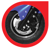
Brakes Disc/Drum & e-ABS

MOTOR BATTERY CHARGING TIME RANGE/CHARGER VOLT AH TOP SPEED CLIMBING CAPACITY CONTROLLER