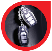
Central Lock Anti-Theft Alarm