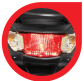
Stylish Back Light