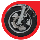
Brakes Disc/Drum & e-ABS