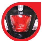
Stylish Back Light