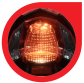
Stylish Back Light