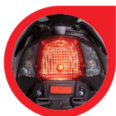
Stylish Back Light