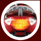
Stylish Back Light