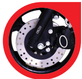
Brakes Disc/Drum & e-ABS

MOTOR BATTERY CHARGING TIME RANGE/CHARGER VOLT AH TOP SPEED CLIMBING CAPACITY CONTROLLER