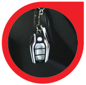
Central Lock Anti-Theft Alarm