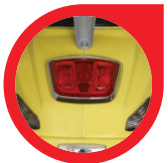
Stylish Back Light