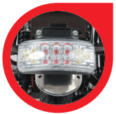
Stylish Back Light