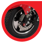
Brakes Disc/Drum & e-ABS

MOTOR BATTERY CHARGING TIME RANGE/CHARGER VOLT AH TOP SPEED CLIMBING CAPACITY CONTROLLER