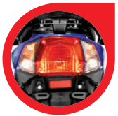
Stylish Back Light