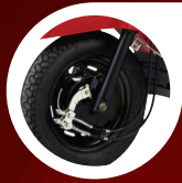
Brakes Disc/Drum & e-ABS

MOTOR BATTERY CHARGING TIME RANGE/CHARGER VOLT AH TOP SPEED CLIMBING CAPACITY MAX LOADING CAPACITY SPEEDOMETER INDICATOR