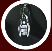
Central Lock Anti-Theft Alarm