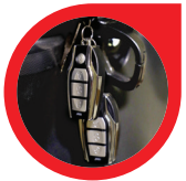
Central Lock Anti-Theft Alarm