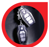
Central Lock Anti-Theft Alarm