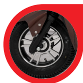
Brakes Disc/Drum & e-ABS

MOTOR BATTERY CHARGING TIME RANGE/CHARGER VOLT AH TOP SPEED CLIMBING CAPACITY CONTROLLER